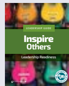
Leadership Readiness: Inspire Others™