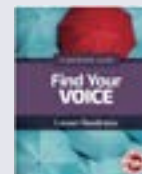
Career Readiness: Find Your Voice™