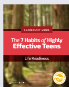
Leading Your Life: The 7 Habits of Highly Effective Teens™